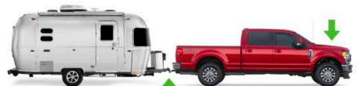
With Weight Distribution Hitch