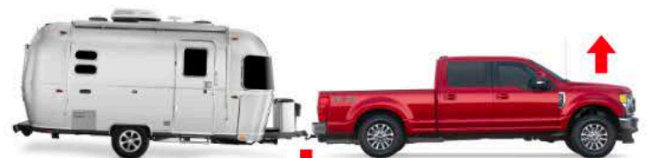
Without Weight Distribution Hitch