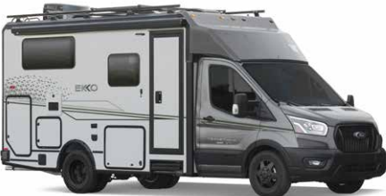
VERDANT II WITH GRAPHICS