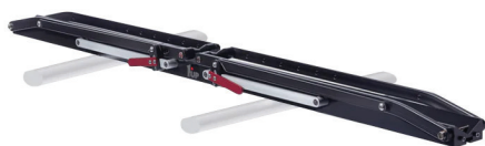
1 Up Bike Tray