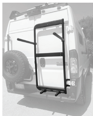
Box & Bike Rack