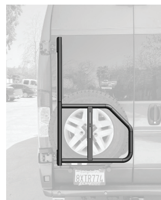
Rear Box/Tire Rack