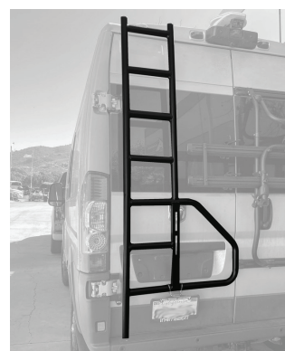
Rear Door Ladder