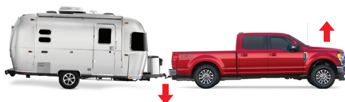
Without Weight Distribution Hitch