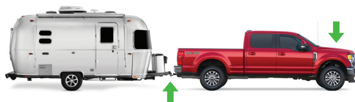
With Weight Distribution Hitch